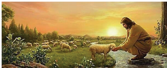
John 10:27-30 ♦ Jesus describes his care for his sheep.

The fourth Sunday of Easter is also called Good Shepherd Sunday. In each of the three lectionary cycles, the Gospel is taken from the tenth chapter of the Gospel of John. This chapter of John's Gospel follows Jesus' healing of the man born blind and the rejection of this miracle by Jewish leaders who question Jesus' authority to heal. Jesus responds to this challenge to his authority by calling himself the Good Shepherd. He is criticizing the Pharisees and other Jewish leaders. Already, the Pharisees and other Jewish leaders are so angered that they attempt to stone and arrest Jesus (see John 10:31 and 10:39). This controversy with the religious leaders continues until Jesus' death.